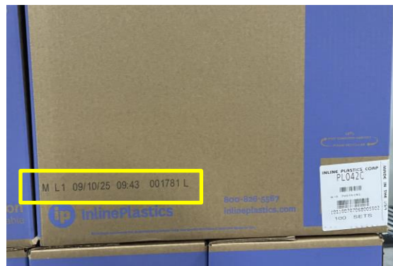
Figure 2: Ink Jet Information

This certificate is continuing and shall remain in full force and effect until revoked in writing. This version supersedes all previous certificates that might otherwise be effective.